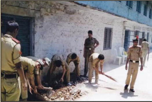
NCC Cdts. are cleaning the College Campus.