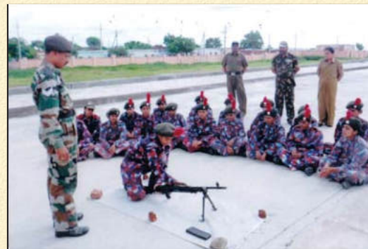
NCC Cadets are practising rifle training in Battalion