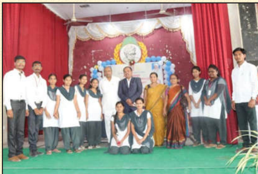
N.S.S Volunteers with Chief Guest and Principal