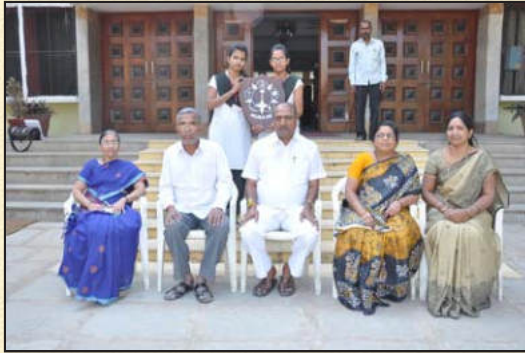
Debate competition winners at Inter Collegiate level.