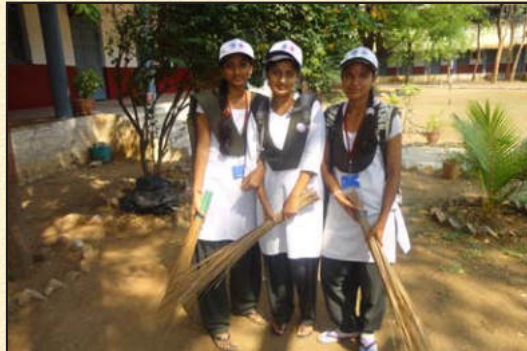
NSS Volunteers are Cleaning the College Campus on Swachha Bharat Abhiyan