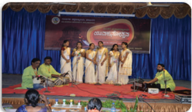
Students performing in Youth Festival Gulbarga University Kalaburagi