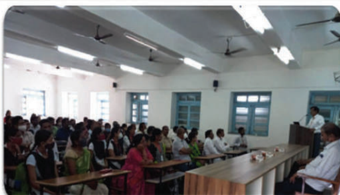
"Parent Meet" in progression