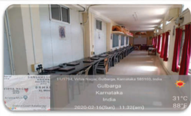
Computer Science Laboratory