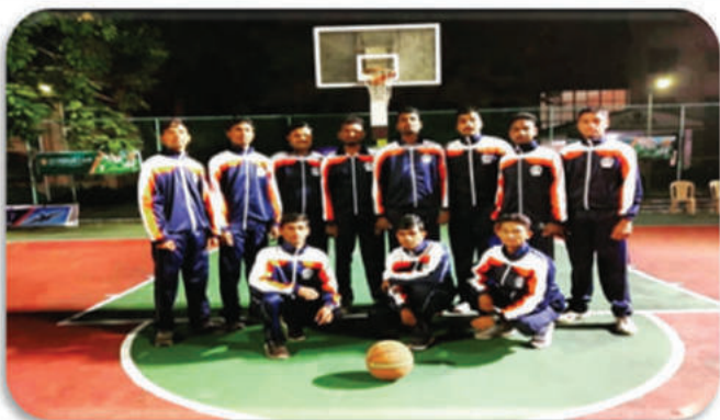
Students Participating in South Zone Level Competitions at Chennai