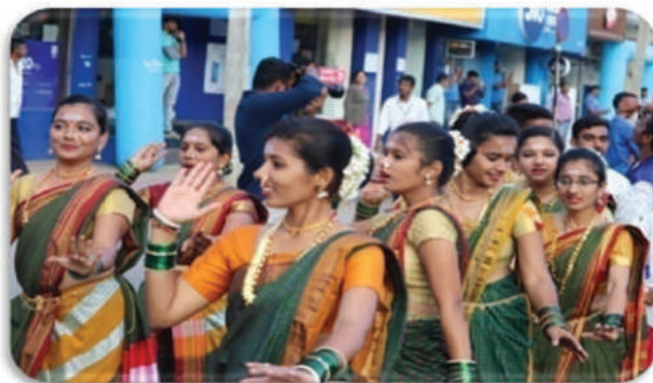
Students performing in Youth Festival -KSOU Mysore