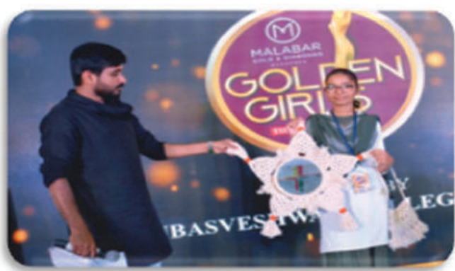
Students performing in Golden Girls Event held in Bengalure