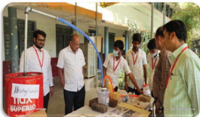
Students showing Production of Bio Gas