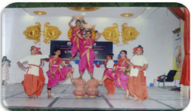
Students performing in College Fest Umang 2020